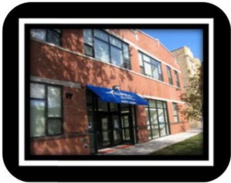
ASPIRA Early College High School