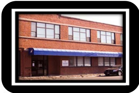
Antonia Pantoja Alternative High School