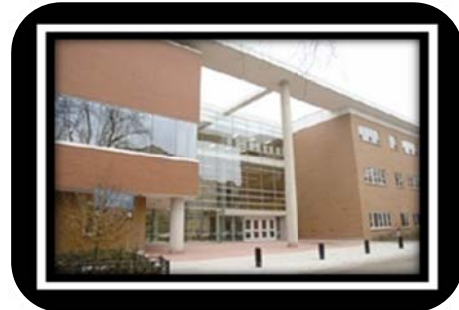
Haugan Middle School